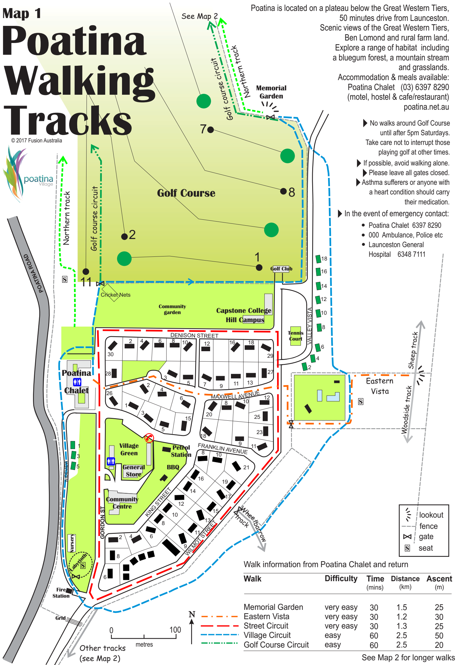
Walk information from Poatina Chalet and return